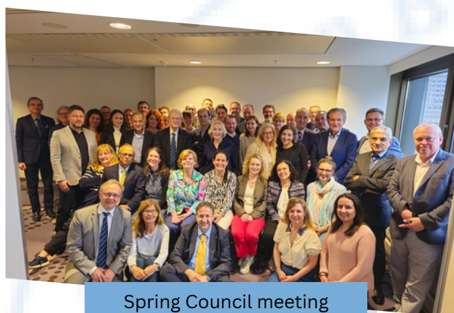
Spring Council meeting 4 June 2025

The Spring Council meeting took place on Wednesday 4 th June 2025 in Frankfurt, Germany. It was an abbreviated format due to its proximity to the congress.